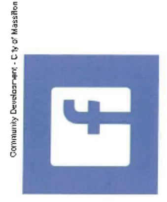
Click here for our Facebook Page!

allocation. Each activity that we undertake using CDBG dollars must meet one of the three National objectives outlined by HUD. The three this funding as an entitlement Community through the U.S. Department of Housing and Urban Development (HUD). Being an entitlement The Community Development Department manages the City's Community Development Block Grant (CDBG) funds. Massillon receives community means rather than having to apply to receive CDBG funding, the City is automatically awarded funds through a formula notional objectives are as follows: