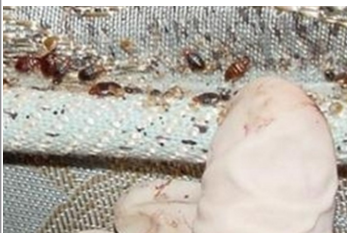
The above picture shows live bugs and black fecal staining within a mattress seam.

Bed bugs love to hide in cracks and crevices typically near their food source, YOU! So begin your search in rooms where people sleep, such as bedrooms, the living room, den, etc. Use a magnifying glass to look for live bugs, shed exoskeletons and small fecal spotting (dark colored staining) in the following areas: