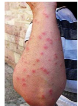
An allergic reaction to bed bug bites.

It is very possible for some family members to develop a rash and not others in the same family. Also, the rash may develop days after the initial bite. Waiting for visible bite marks to indicate a problem would not be recommended. Routinely, check around your sleeping area for signs of bed bugs.