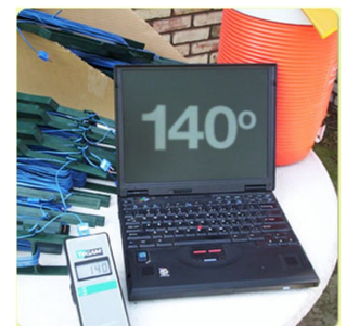
Computers are used to control the temperature during whole house heat treatments.

Many homeowners want to do treatments themselves, in most situations it is not advised. Please do not set off bug bombs, which cause the bugs to scatter and worsen your situation. The chemicals you can purchase without a license are not very effective on this elusive insect.